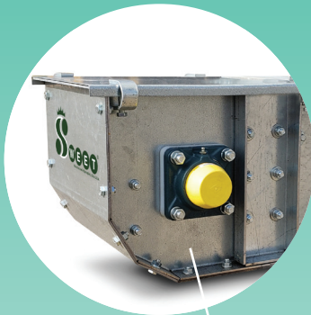
Fixed-position guarded shaft with curve return bottom