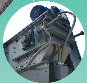
Heavy-duty screw take-ups with plate weldments